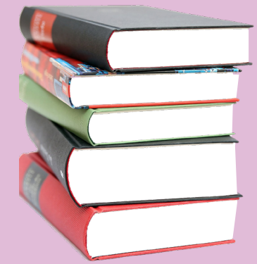
Page 3 - College campus support for foster care youth

In this issue: Page 1 - Tell families to join the fun and meet youth at the same time